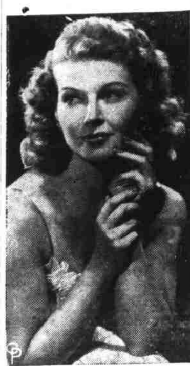
ONE OF THE MANY stage, screen and radio stars scheduled to attend Easter Sunrise Services at the Hollywood Bowl on April 25 will be Irene Manning who will appear as vocal soloist.