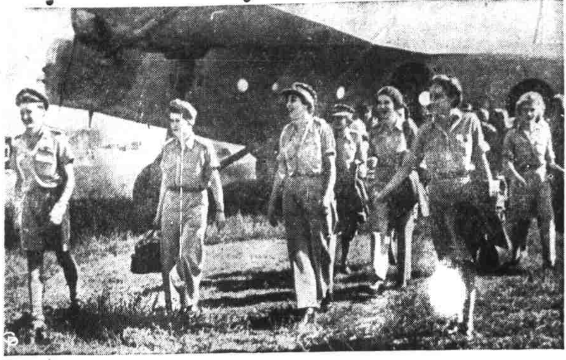
EAGER TO GET TO WORK, the first group of Allied nurses to arrive in Italy by air leave an ambulance plane on a field on the southern mainland. Many of the nurses are now stationed at front line field hospitals, bringing medical comfort to soldiers and civilians alike.

Before he went upon the bench his powerful voice was heard in every campaign. He often served as Presidential elector, and was a delegate to the National Convention at Chicago when President Roosevelt was first nominated, and in that campaign at his own expense he made more than thirty speeches, pleading the cause of Jeffersonian Democracy. It is no wonder that this man of high ideals, lofty patriotism and eminent public service, should have been selected by Western Carolina Teachers College as its most distinguished graduate.