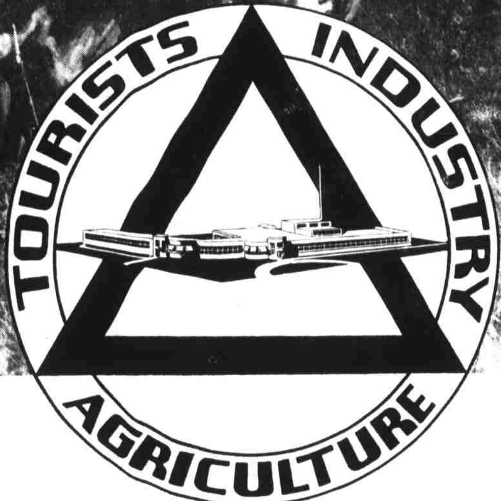
The Magic Circle