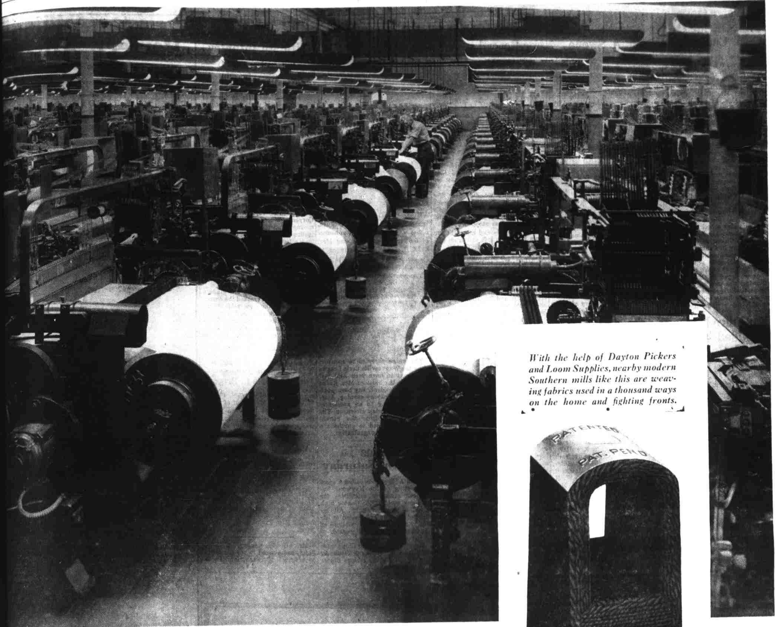
With the help of Dayton Pickers and Loom Supplies, nearby modern Southern mills like this are weaving fabrics used in a thousand ways on the home and fighting fronts.