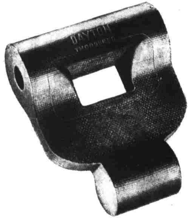
In nearby Southern mills like this there are being woven today—with the help of Dayton Pickers and loom supplies, fabrics used in a thousand ways on the home and fighting fronts.