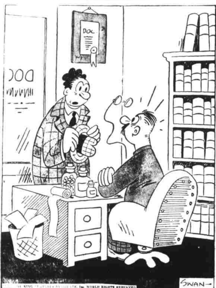
"I know I haven't paid your bill, Doc. You told me to avoid business worries for the next six months!"