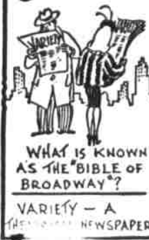
WHAT IS KNOWN AS THE BIBLE OF BROADWAY? VARIETY - A NEWSPAPER