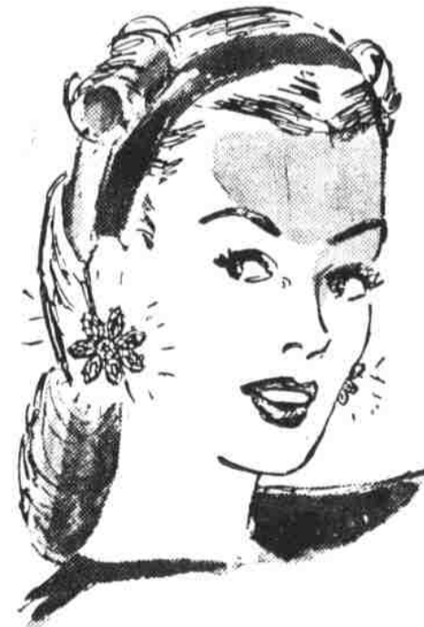
She's expecting some Costume Jewelry — we have just what she wants.