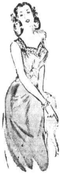
GIFT! LACY GOWN

Extra flattering nightie in soft rayon satin, with handsome lace. White, peach.