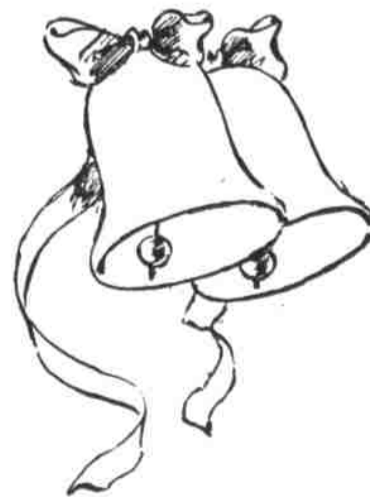
and from all of us at The Union Season's Greetings.

Hand it to her in a pair of our lovely Gloves.