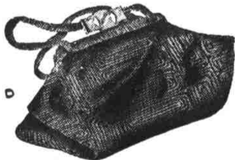
A lovely selection of Bags — a practical gift for her.

Lingerie love for her Christmas! Figure-moulding slip in lacy rayon crepe or satin.