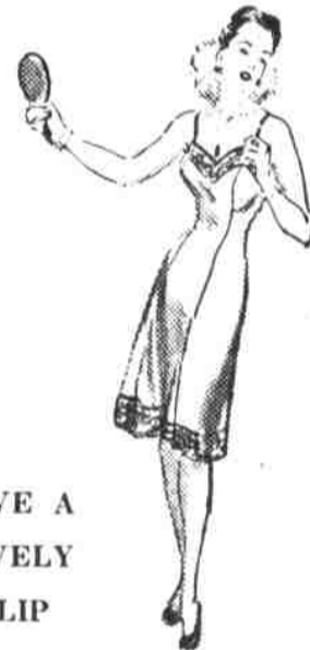
GIVE A LOVELY SLIP

Lingerie love for her Christmas! Figure-moulding slip in lacy rayon crepe or satin.