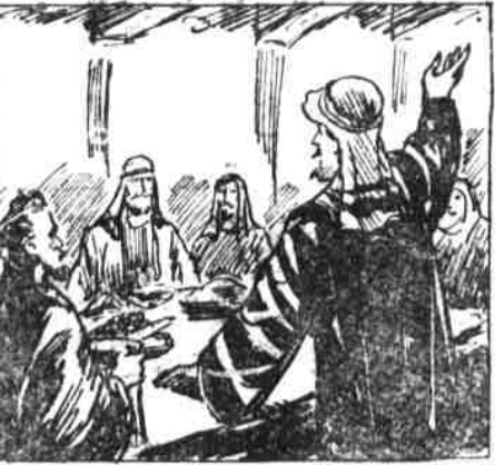
And when thou live in comfort and plenty in the new land, Moses told them, forget not the blessings of Jehovah. MEMORY VERSE—Psalm 136:1