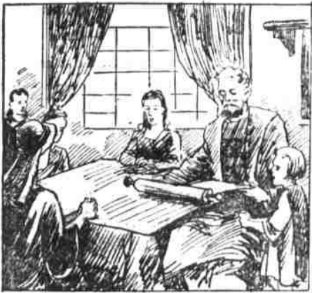
"Thou shalt love Jehovah thy God with all thy heart." These words "thou shalt teach diligently to thy children and shalt talk to them in thy house"