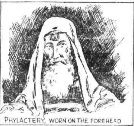
PHYLACTERY, WORN ON THE FOREHEAD