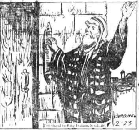
"And thou shalt write them upon the door-posts of thy house, and upon thy gates," remembering Jehovah who delivered His people