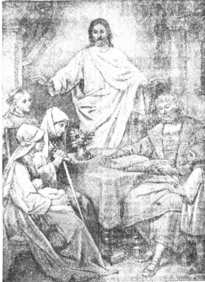
The presence of the Lord.

"O give thanks unto Jehovah: for He is good."—Psalm 136:1.