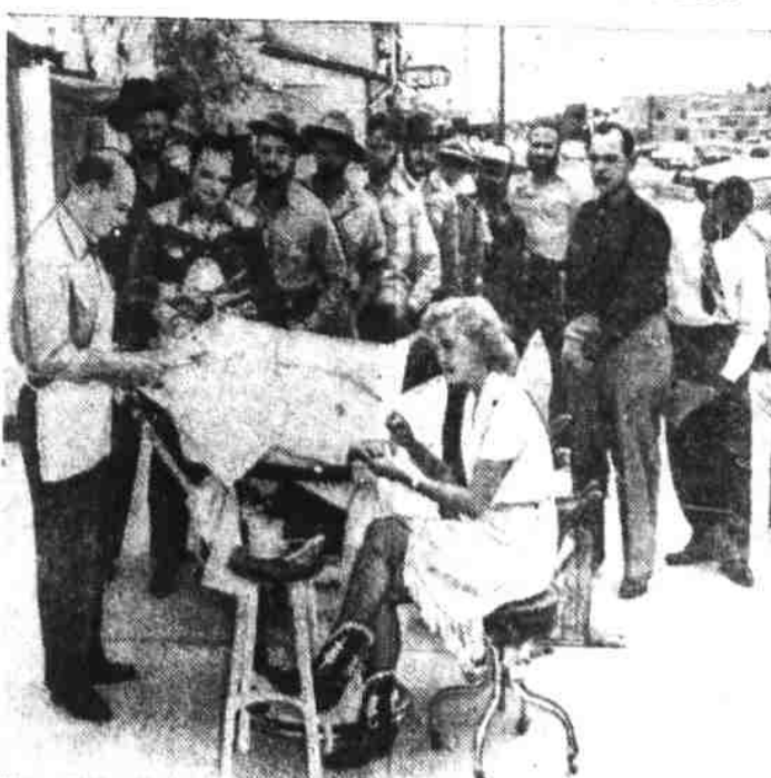
CHINS ARE UP in Las Vegas, Nev., as the annual "Carnival of Helledorado" ends and the old-fashioned whiskers raised by the occasion are chopped off. Here a line of "whiskerers" line up waiting their turn to lose their crop of chin spinach.