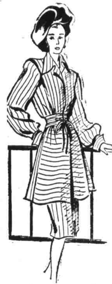
Gray wool casual coat.