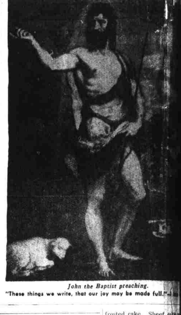
John the Baptist preaching. "These things we write, that our joy may be made full."