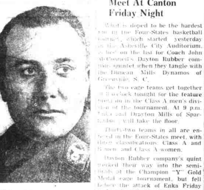
HITLER'S missing deputy, Martin Bormann (above), was believed an important figure in the underground Nazi organization uncovered by U. S. and British officials in the Harford, Germany area reportedly armed with a secret bacteriological weapon, plotters were said to be planning another Hitler-type beach.