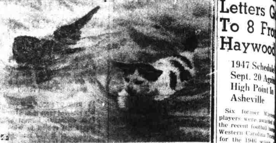
HAWAIIAN SURF RIDERS, Solomon and Duncan, purr for brine.