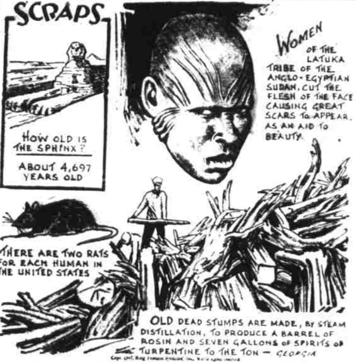
HOW OLD IS THE SPHINX? ABOUT 4,697 YEARS OLD