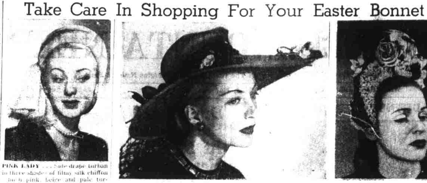
BIG-TIMER . Big-brimmed charmer of red milan with clusters of cherries and cherry blossoms on the crown, and navy fishnet veiling caught under the brim and looped in back. Perfect for year with new spring navy and later with summer prints. By