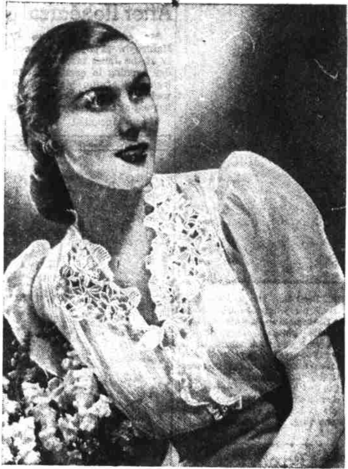
SWISS ORGANDIE... Missing since the war, this favorite sheer is back in exquisite blouses such as this, with pin-tucks, frills and cut-out embroidery.