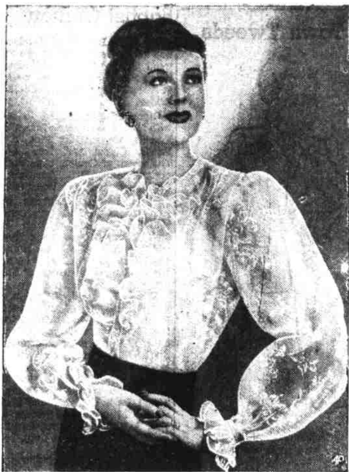
IMPORTED FROSTING... Frothing self-ruffles trim the front of this dainty blouse in floral shadow print Swiss organdie. Note full sleeves, wrist ruffles.

Associated Press Fashion Editor Back after a five-year absence are Switzerland's matchless sheer cotton fabrics, available in blouses, dainty graduation and dance frocks and, in limited supply, in piece goods. There are fine organdies, both embossed and plain, batistes, embroidered sheers and novelty weaves. The famous transparent Swiss organdie is available in blouses either tailored or frilly, but always crisp and fresh as a frosting for spring and summer suits. Some are so lovely that they may be worn as evening blouses, with a long evening skirt. Embroidered versions in both solid and cut-out styles are especially effective. The new shadow-printed organdies come in all-over lace effects