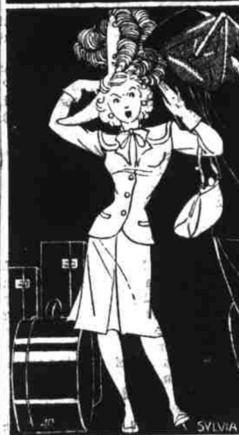
TRAVEL ERROR... Don't wear a large, befeathered hat on a train or plane. It may look all right at a tea party, but it will annoy your fellow travelers.