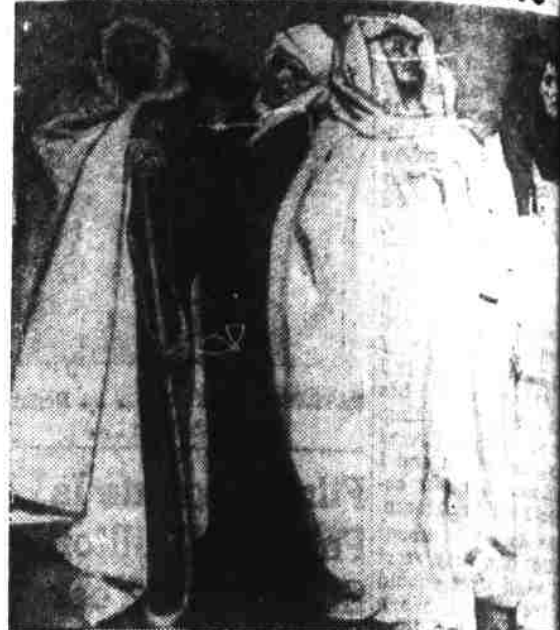
Prophets Amos, Nahum, Ezekiel and Daniel.

"Seek good, and not evil, that ye may live."—Amos 5:14.