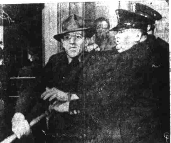
HOLDING TIGHT to the cop's club, a Bell Telephone picket in Detroit is rushed away by two policemen after several strikers attempted to interfere with a person entering the telephone building...