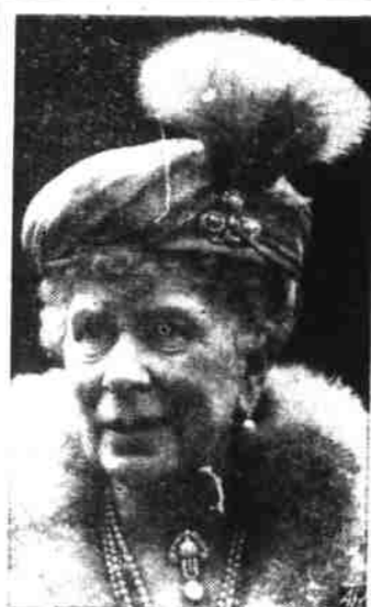
MARY OF ENGLAND "Every inch a queen"

AP Newsfeatures LONDON—The sprightliest old lady in England turned 80 on May 26. "Princess May" they called her in the days of the empire builders. Queen Mary is her title now, a name revered by millions of Britons, Canadians, Australians, South Africans, New Zealanders and colonialists in an era when the empire of her grandson shrank day by day. She has been a dowager queen, a queen in name only, since the death of George V, her husband, eleven years ago but the cheer that goes up when her ancient red limousine appears gives evidence that the British people's regard for her does not go by the calendar. They look at her hair when they remember them. They may find her more radical subjects do more than whether the monarchy is needed in the modern world but they smile affectionately when the old queen's name is mentioned and they never fail to cheer her when he passes.