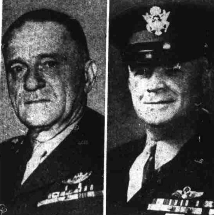
GEN. CARL SPAATZ GEN. H. H. ARNOLD

FORMER AIR CORPS chief, Gen. H. H. Arnold and Gen. Carl Spaatz, its present commander, will be summoned to appear before the Senate War Investigating subcommittee if Sen. Claude Pepper (D-Fla.) is able to enforce his demand on the committee chairman The Solon has asked they be called to establish the need for the photo reconnaissance planes recommended by Elliott Roosevelt during the war.