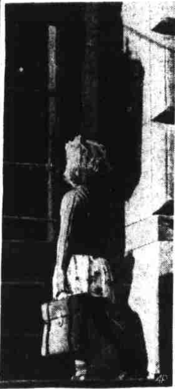
BACK TO SCHOOL—Millions of new students are expected in the U. S. school system.

The drive to meet the emergency situation has long since started throughout the country. At least 44 state legislatures have made major adjustments in school laws. Many communities have adjusted teacher pay with or without state aid in an effort to hold teachers at