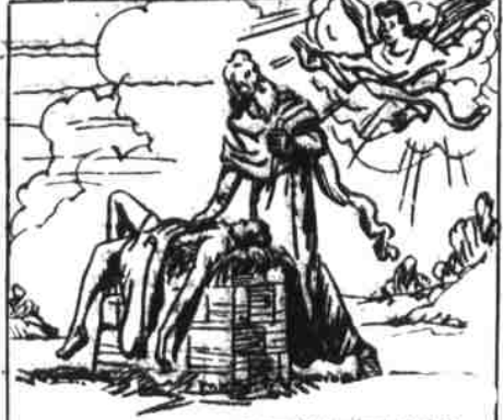
By faith, Abraham, when he was tried, offered up Isaac: and he that had recaived the promises offered up his only begotten son