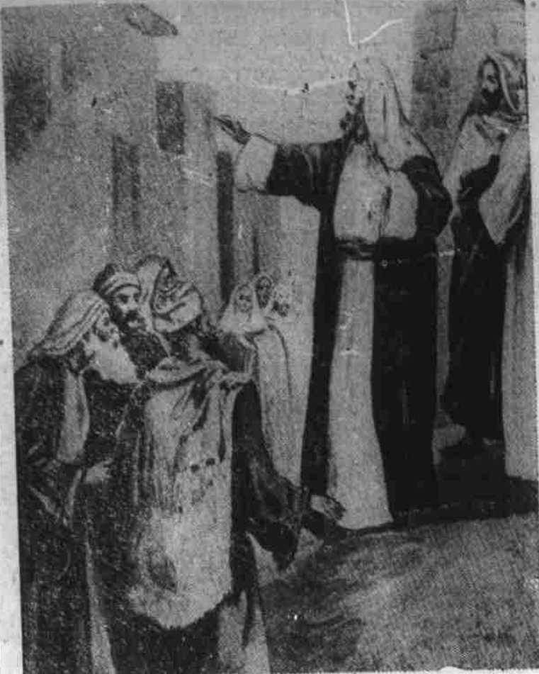
The apostles preaching in Jerusalem. "Repent ye and be baptized every one of you in the name of Jesus Christ unto the remission of your sins; and ye shall receive the gift of the Holy Spirit."—Acts 2:28.