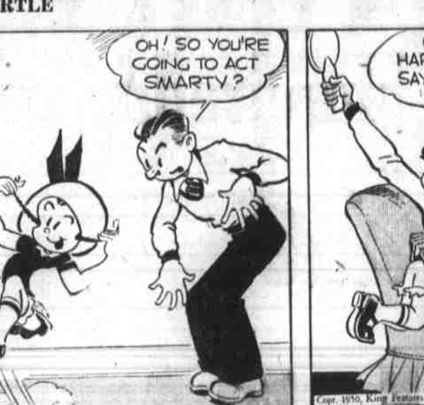
RIGHT AROUND HOME