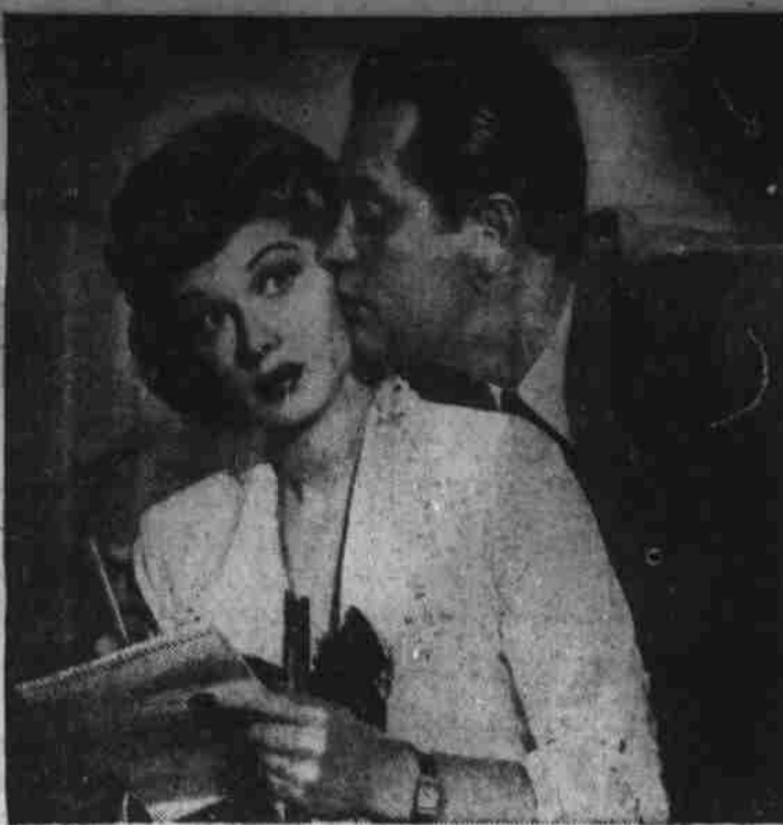
Richmond Surrenders! Lucille Ball and William Holden are starred in Columbia Pictures' "Miss Grant Takes Richmond," hilarious new girl-takes-boy escapade at the Park Theatre. Holden is the "defeated" Richmond.