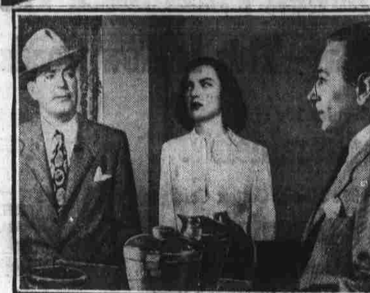
Pat O'Brien, George Raft, and Ella Raines starring in "A Dangerous Profession" opening at the Strand Theatre Tuesday.