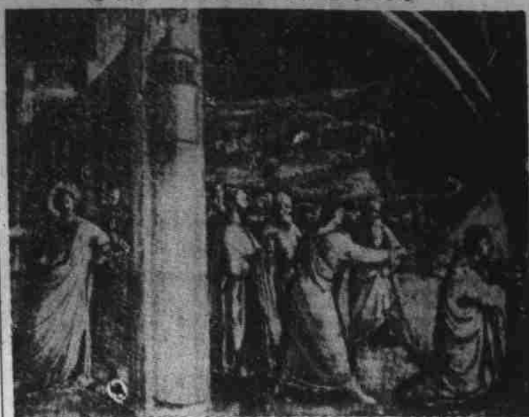
The stoning of Stephen.

"Be ye faithful unto death, and I will give thee the crown of life."—Revelation 2:10.