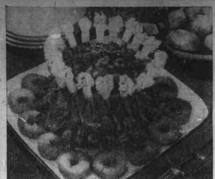
CROWN LOAST . . . Special pork treat for company.

The warmth of the Gulf Stream makes Murmansk the only ice-free Russian port except those on the Black Sea, Archangel, five degrees farther south, is icebound in win-