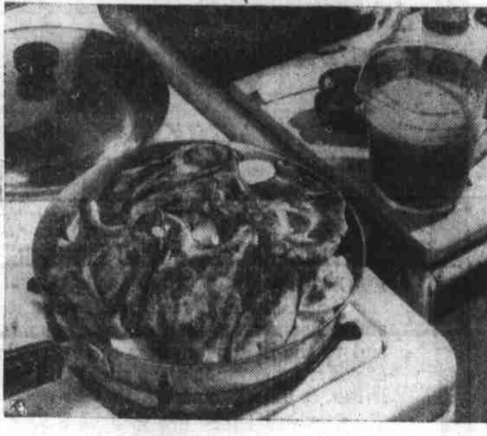
PORK CHOPS . . . Vitamins for the family

Method: Brown park chops in skillet; remove from pan. Starting with potatoes put vegetables in layers in a deep 2-quart skillet. (Reserve about 1/3 of the green pepper, celery and onion.) Sprinkle each layer with part of the salt and pepper. Place the brownd pork chops on the top of the vegetables. Top with remaining green pepper, celery and onlon. Sprinkle with remaining salt and pepper, Mix together tomato soup, water and tabasco sauce; pour over meat. Cover and cook on top of range over low heat 1 to 11/2 hours. Makes 4 servings.