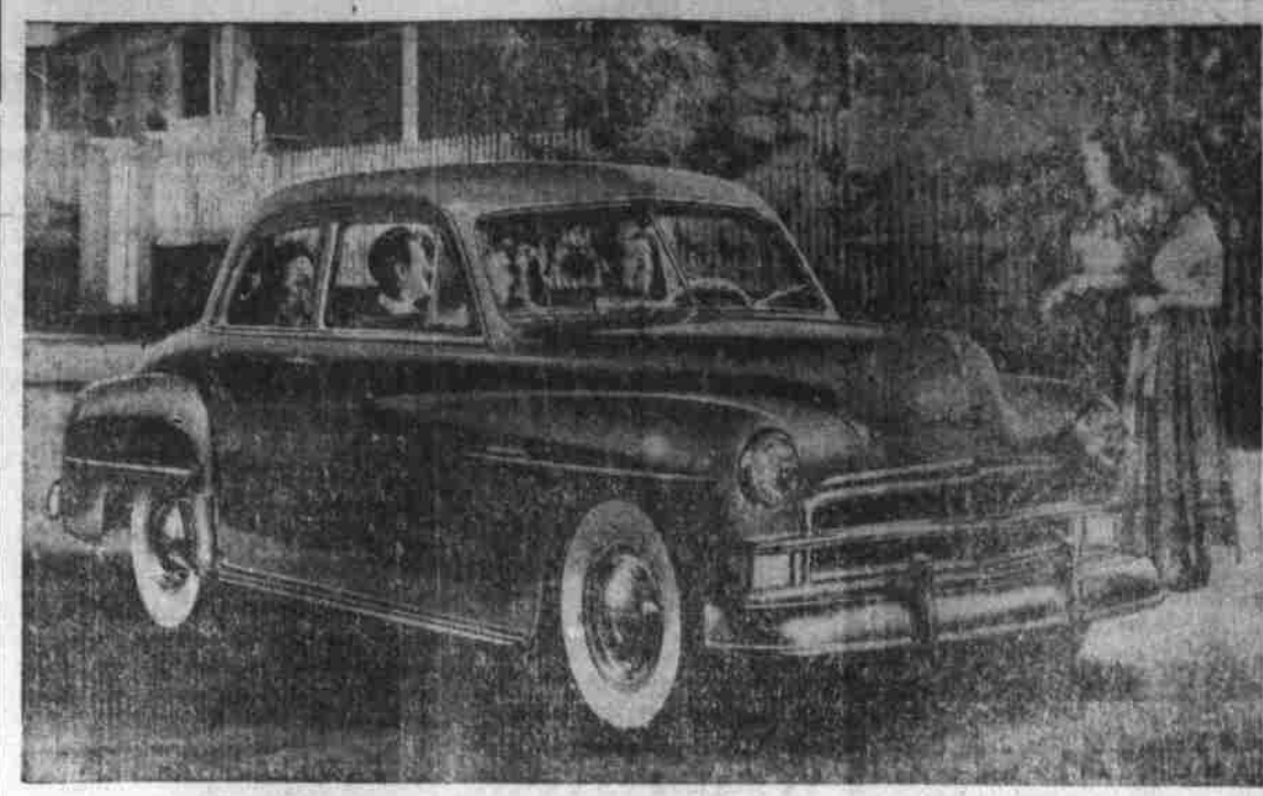
The Plymouth Special DeLuxe Club Coupe, one of nine new models, is shown above. The car contains imporcant styling changes and improvements for safety and comfort. Its high compression engine and many me chanical features provide lively, economical performance.