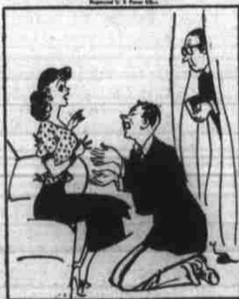
"How timely a visit, Doctor Divine!"