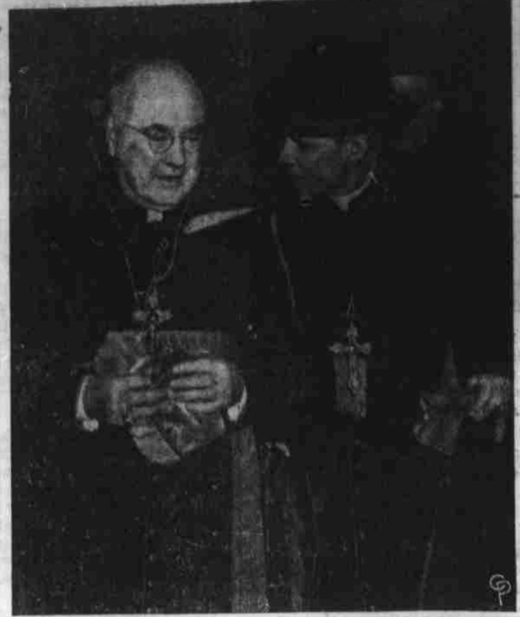
EN ROUTE TO ROME with 500 American Holy Year pilgrims, Francis Cardinal Spellman (left) is warmly greeted in Lisbon, Portugal, by the Bishop of Mitelene. The Cardinal read a special prayer.