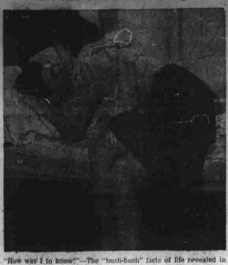
every detail!-"Because Of Eve" coming to Strand Theatre Thursday only. Segregated audiences - Women 3:00 p.m. - 7:00 p.m.; Men at 9:00 p.m. only.