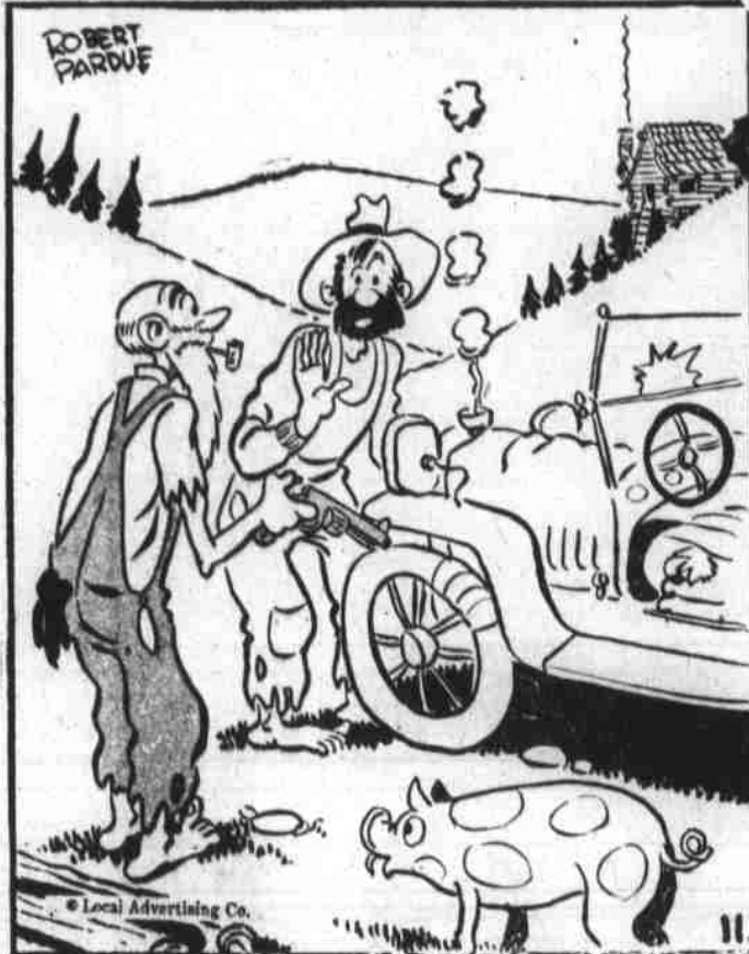
"Don't shoot it Pappy! WATKINS CHEVROLET will trade us a good used car for it."