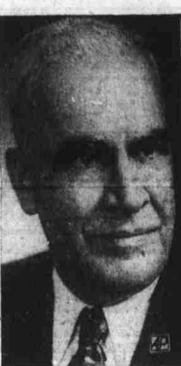
Luther H. Hodges, Sr., (above), general manager of the Fieldcrest Mills at Spry, has accepted appointment with the ECA as chief of the industry division in Western Germany. He will leave for Frankfurt, Germany, April 5. Hodges is a vice president of Marshall Field & Company which owns Fieldcrest Mills.