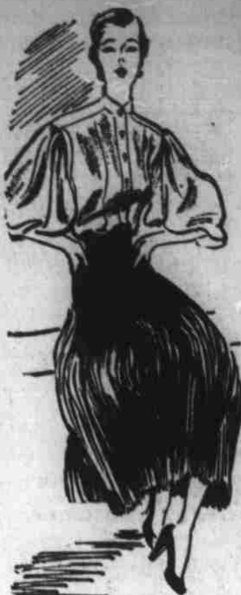
Blouse and skirt costume.