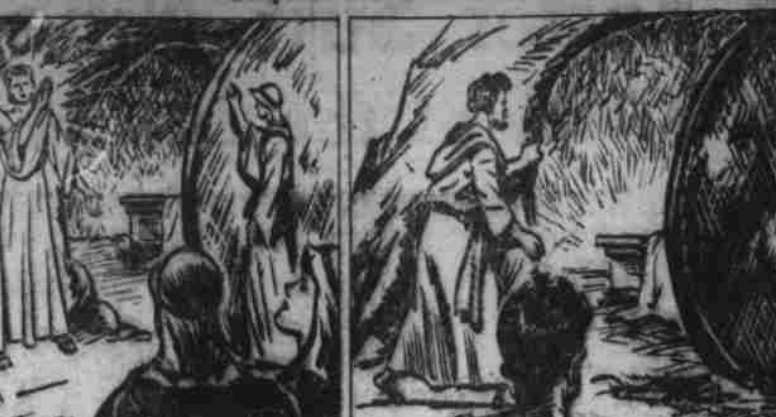
The women found the body of Jesus gone, and as they stood, much perplexed, two men in shining garments stood near them. The women prostrated themselves and heard the men say, "He is risen."