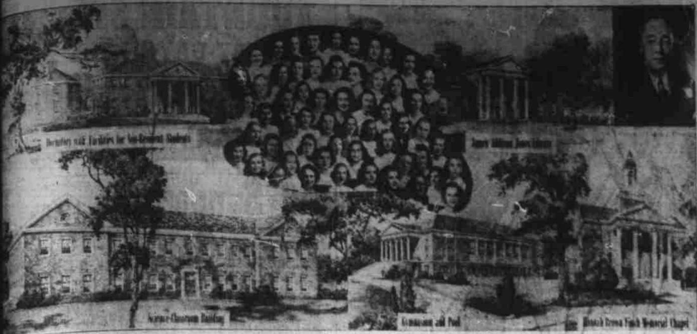
Two new buildings are now under construction, the James Addison Jones Library and the Science-Classroom Building, both scheduled to be completed by the opening of college in September. Planned to be built as rapidly as additional funds are made available are a Chapel, a Gymnasium and Swimming Pool, and a new Dormitory with accommodations for non-resident students. Present buildings on the 112-year-old campus are: Main Building, Odell Memorial, Fitzgerald Hall, Hudson Hall, Student Hospital, Home Management House, Faculty House, and Student Activities Building.