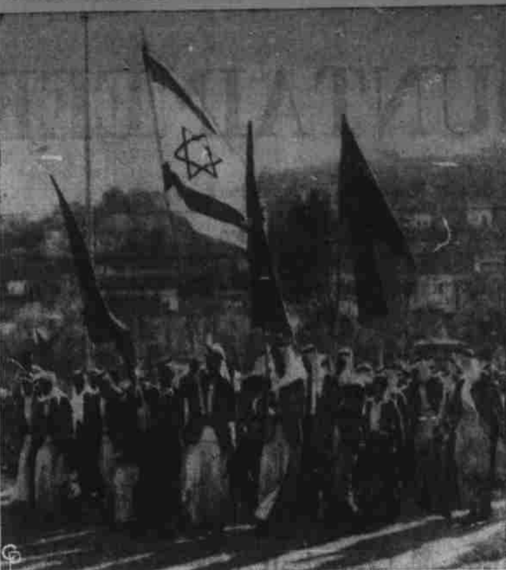
EN ROUTE TO A MEETING of the Palestine Labor League, Arab delegates, one carrying the flag of Israel, march through Nazareth. The Arabs represented 11,000 laborers in 34 towns. The League is a branch of the "Mapai", politically similar to British Labor party.