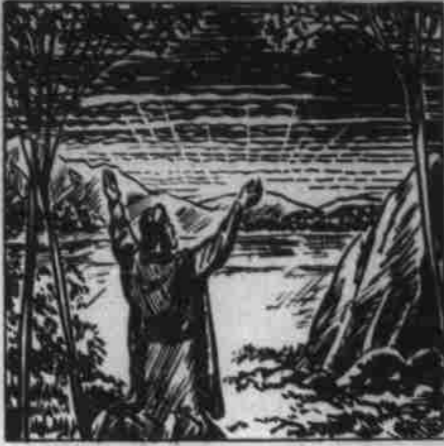
Seek the Lord, who made the stars, "and turneth the shadow of death into the morning; the Lord is His name," Amos pleaded with his erring people.

Scripture—Amos 4:4; 5:4-9, 14, 15, 21-24.