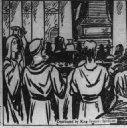
The Lord hates the feast days, the solemn assemblies, and the burnt offerings while the rich oppress the poor and live immoral lives, declared Amos.