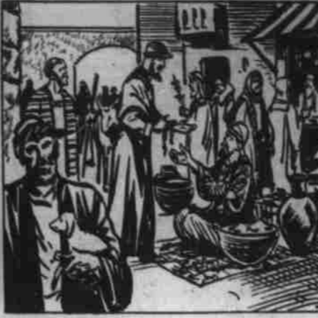
"Hate the evil and love the good, and establish judgment in the gate"—the market place where the poor were cheated—so that God would be gracious.