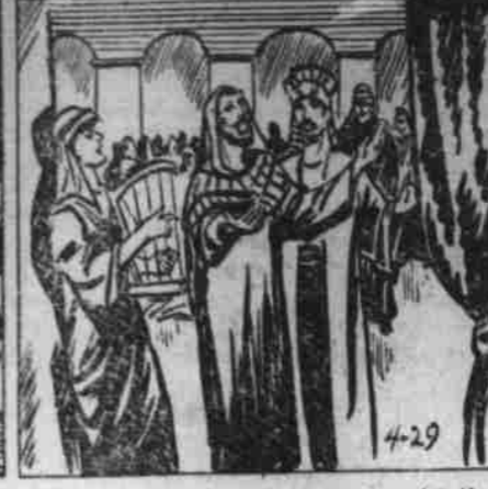
Even the religious songs sung to the "melody of thy viols" are displeasing to Jehovah without right living. MEMORY VERSE—Amos 5:24.