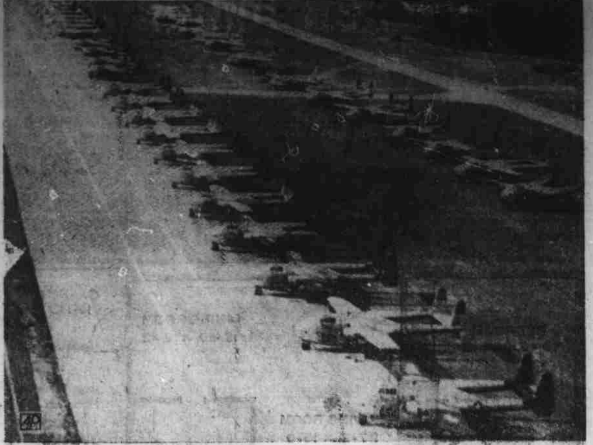
These Air Force planes are lined up at Camp Mackall, in readiness for war games called "Exercise Swarmer". They are waiting for their cargoes of pried on in a shooting war instead of a cold war, would happen if the Berlin Airlift had to be caratropoos, guns and jeeps to demonstrate what Taking part in the maneuvers are 600 planes and 60,000 men.