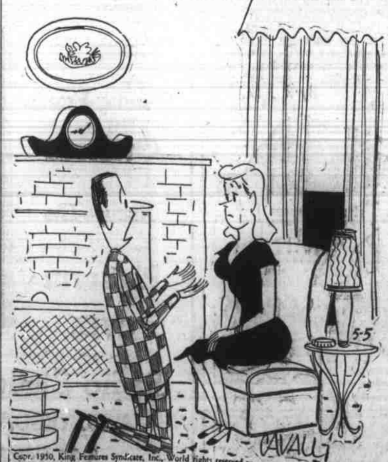
"My nights are so long... so lonesome. No one to talk to... my television set is out of order."