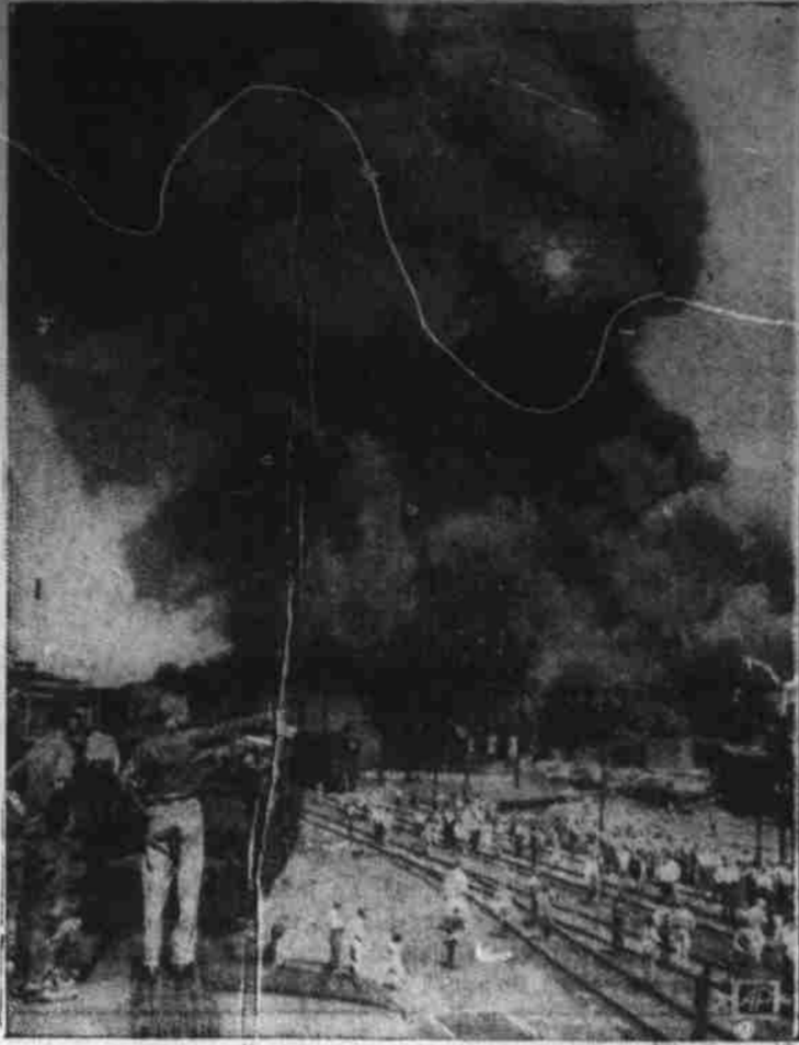
A terrifying pillar of dense black smoke boils into the sky from flames roaring through an industrial section of North Wilkesboro. The area was gutted and damage was estimated at $1,000,000. Starting in a big lumber plant, the fire destroyed it and 4,000,000 feet of lumber, an ice and fuel plant, and a flour and feed mill.