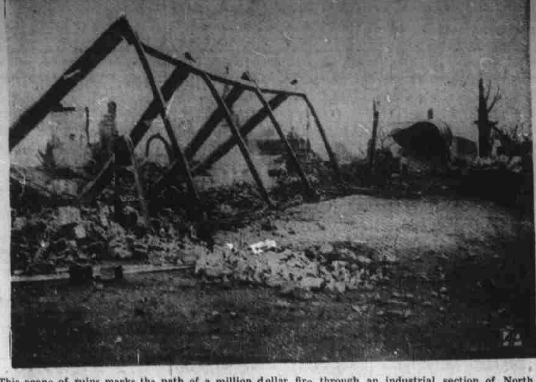
This scene of ruins marks the path of a million dollar fire through an industrial section of North Wilkesboro. The flames broke out in a lumber plant, one of the biggest in the state, and spread rapidly with high wind. Four million feet of lumber was destroyed, along with a lumber mill, an ice and fuel plant, a flour and feed mill and a trucking terminal.

Pacific Coast Reviving Air Raid Patrols HAMILTON FIELD, Cal. (UP)—Maj. Gen. Hugo P. Rush, commanding officer of the Western Air Defense Command, announced that the Pacific coast wartime air raid warning system is being reactivated. The move was asked by the federal government "because of the possibilities of conflict," he said. Rush added there was no need for public hysteria that the step was just a "good insurance policy." During World War II volunteers manned observation posts and aircraft position plotting centers. Specific arrangements for recruiting the volunteer workers were not immediately announced, but it was estimated the set-up would require 30,000 workers in California, Oregon and Washington.