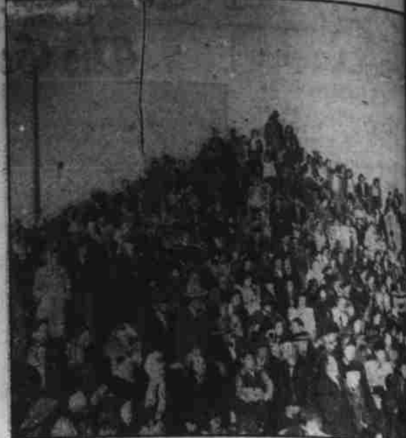
Part of the huge crowd of thousands which each year view the famed Wichita Mountain Easter pageant.