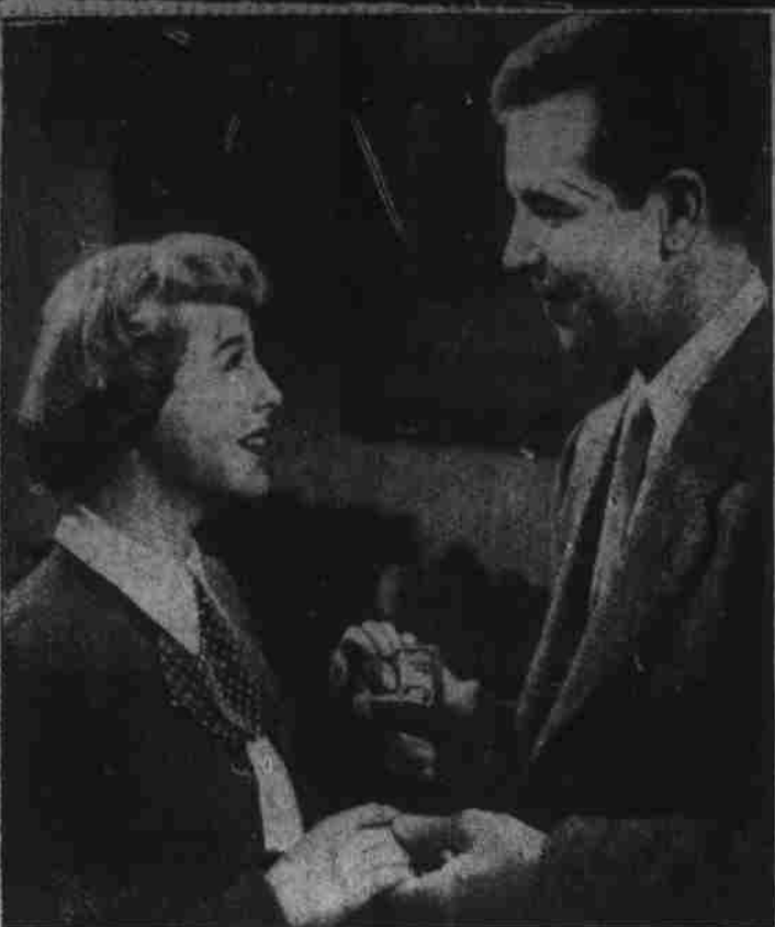
June Allyson accepts an engagement ring from Dick Powell in "The Reformer and the Redhead," M-G-M's romantic comedy in which June and Dick, who are Mr. and Mrs. in private life, appear on the screen together for the first time since their marriage. Incidentally, the ring is the same one which Powell gave Miss Allyson when he proposed to her in real life. "The Reformer and the Redhead" coming to the Strand Sunday, Monday and Tuesday.