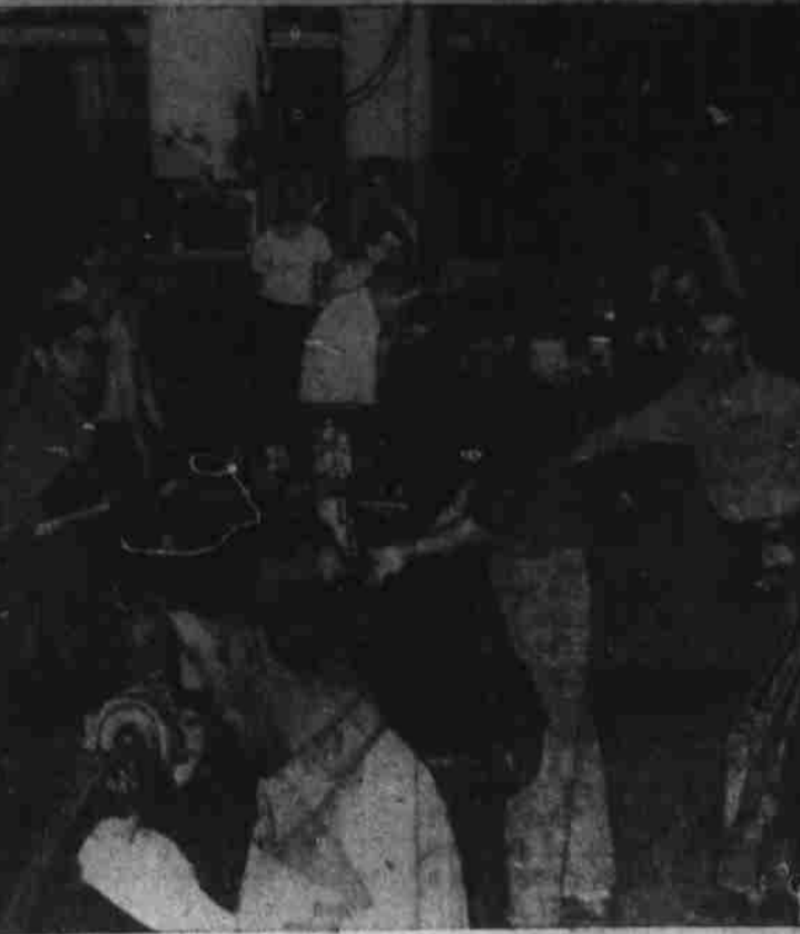
THE ASSEMBLY LINE at a Detroit Chrysler plant swings into action again as automobile workers get back on the job after their 100-day strike. In the meantime, the United Auto Workers were threatening a strike against the General Motors Corporation.