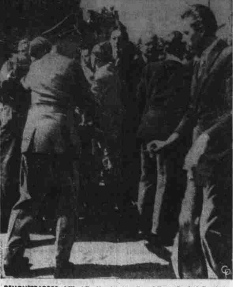
DEMONSTRATORS of West Berlin attack police of East (Soviet) Berlin in one of many clashes on May Day, when Communist youths had threatened to march into the allied zone. This particular brush took place in the Potsdamerplatz, nerve center of the city.