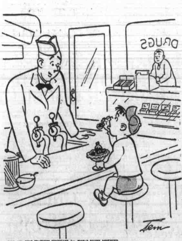
WHENEVER I eat spinach I have to have a chaser.