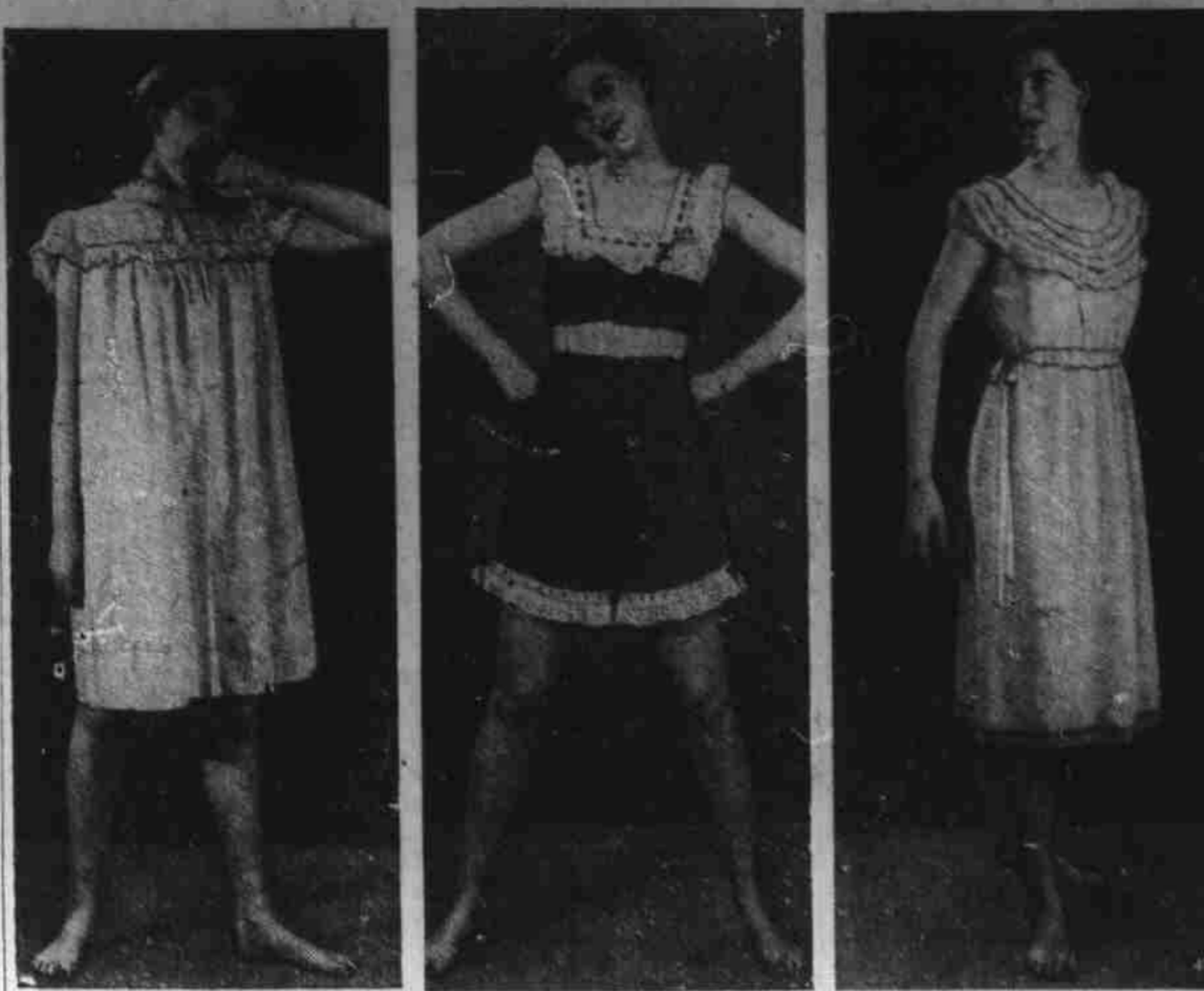
SHORTIES OF 1950... Here are three styles of abbreviated sleepwear designed by Gottlieb. They are (l. to r.): The knee-high nightgown in pale blue batiste with lace yoke, the bare-midriff pajama in scarlet seersucker with eyelet and ribbon trim, and the flapper gown in tangerine crepe with lace trim.