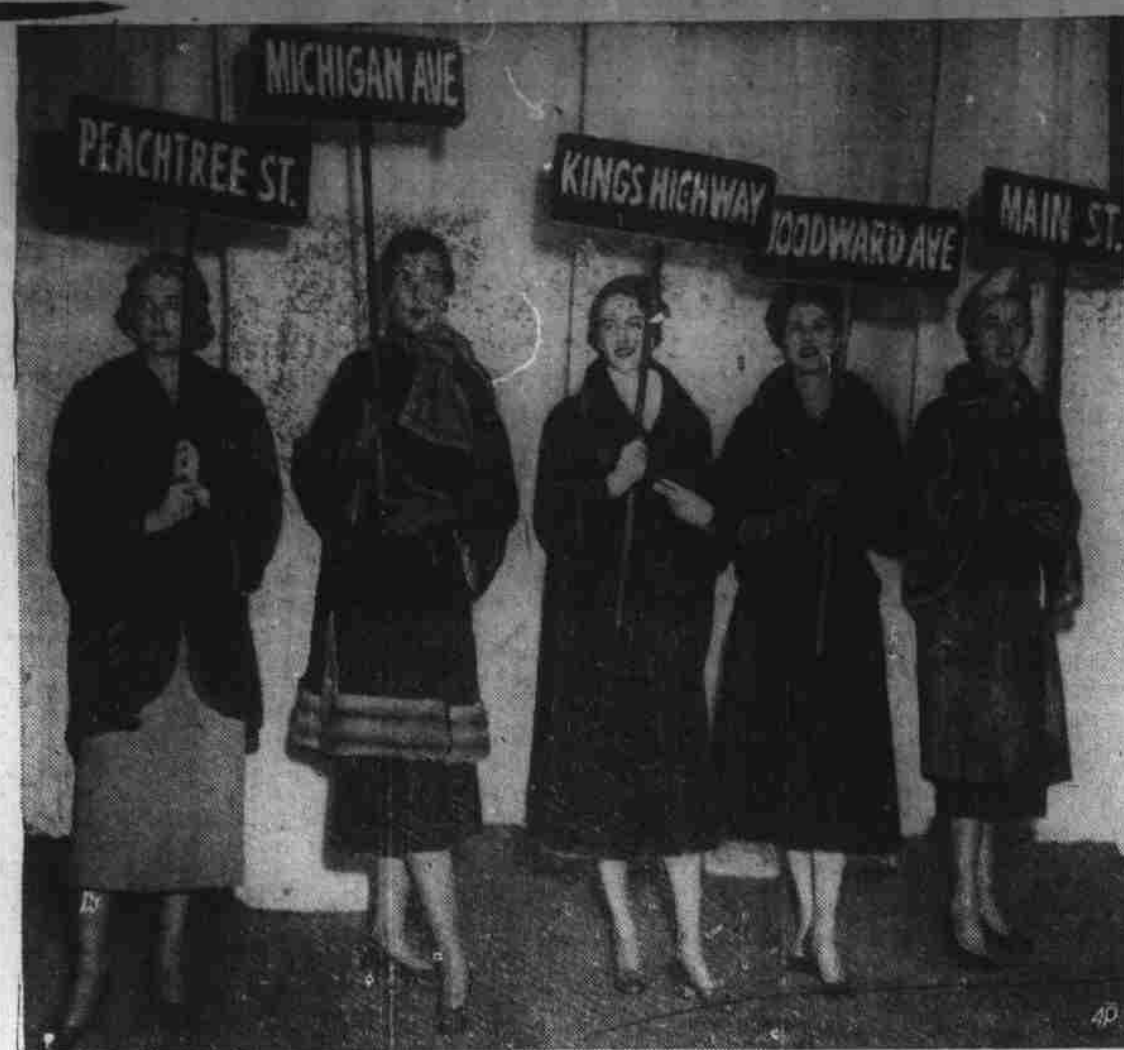
CROSS-COUNTRY FURS... Here are the coats Mrs. U.S.A. will be wearing next winter: Peachtree St., brown squirrel; Michigan Ave., black Persian trimmed in blond mink; Kings Highway, black seal greatcoat; Woodward Ave., belted black seal; Main St., gray Persian trimmed in gray squirrel, with new wide shorter sleeve.