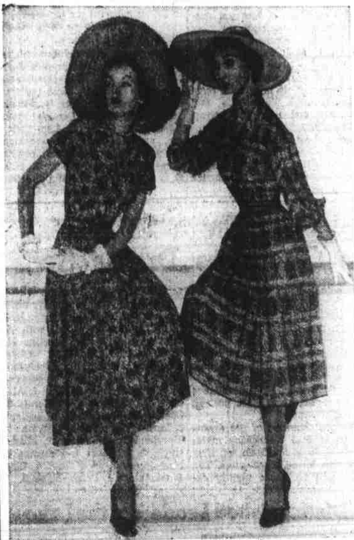
BREAKING INTO PRINT... It's an old summer custom, rightfully popular, as illustrated by these cool charmers. "Brighter Day," at left, in pastel tints, and "Big Sister," at right, in casual shirtwaist style.