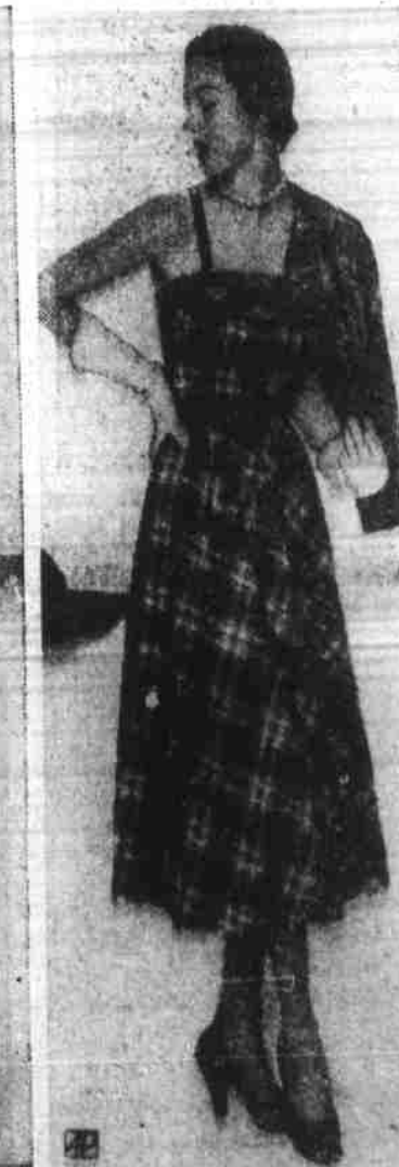
TWO TIMER... Gay plaid makes a convertible sun-or-town dress called "The Right to Happiness."