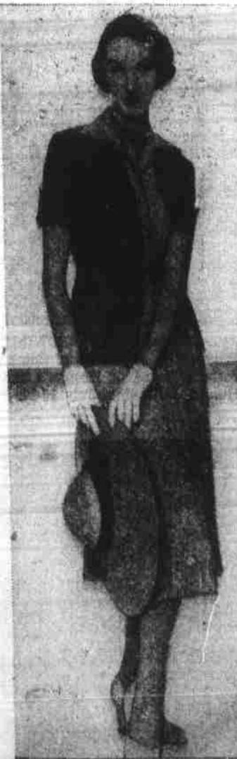
GUIDING LIGHT... That's the name of this summer print dress with cardigan jacket in butcher linen.