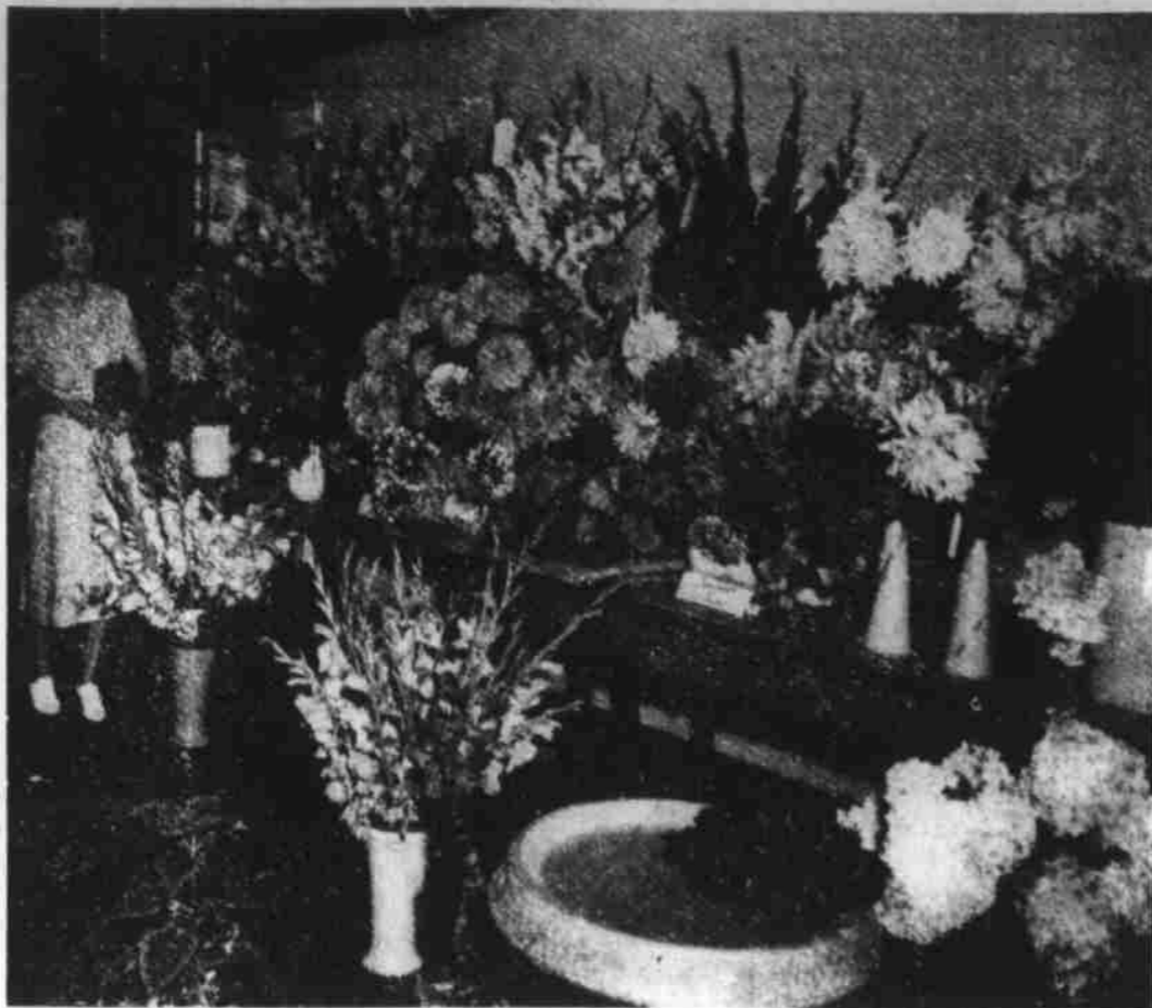
This picture was made last year at the Flower Show staged by the Richland Garden Club. The same organization will put on a similar show again Tuesday and Wednesday at the Armory.