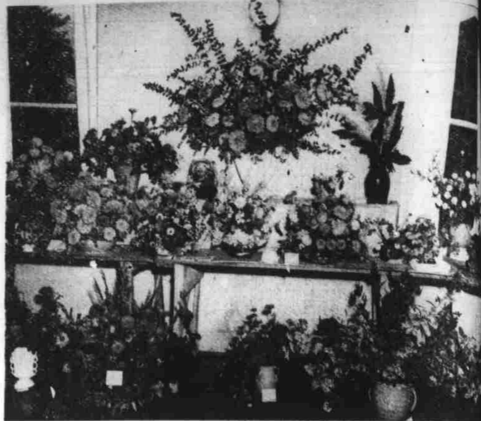
This is another scene from the 1949 show of the Richland Garden Club. Scene similar to this was familiar to those attending the 1950 show Tuesday and Wednesday at the Armory.