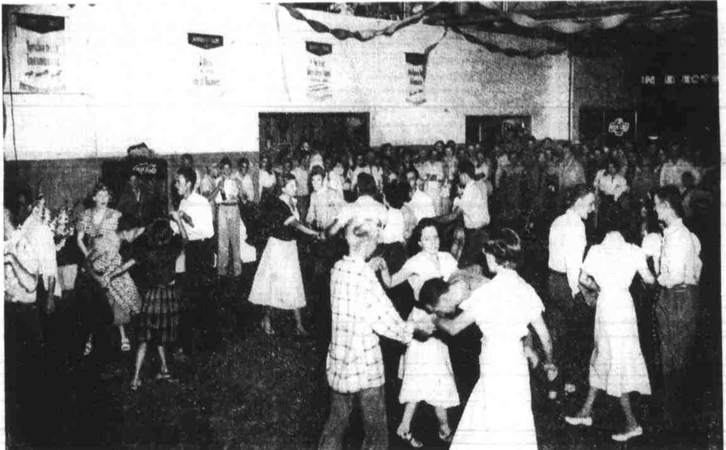
This is part of the large crowd who attended our Square Dance last Friday night —

Our Opening Last Friday And Friday Night Was a Huge Success — Large Crowds Attended Both The Open House Celebration On Friday And The Square Dance On Friday Night — We Sincerely Appreciate The Many Compliments Paid Us On Our Modern Garage And The Many Kind Expressions We Received During Our Open House Celebration —