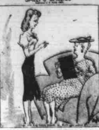
"George insists we'll have to provide a new crop of pinup girls, cold war or hot."