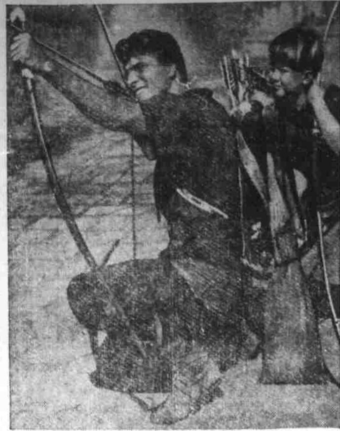
Burt Lancaster starring in Warner Bros. Technicolor hit "The Flame and the Arrow." Also starring Virginia Mayo.