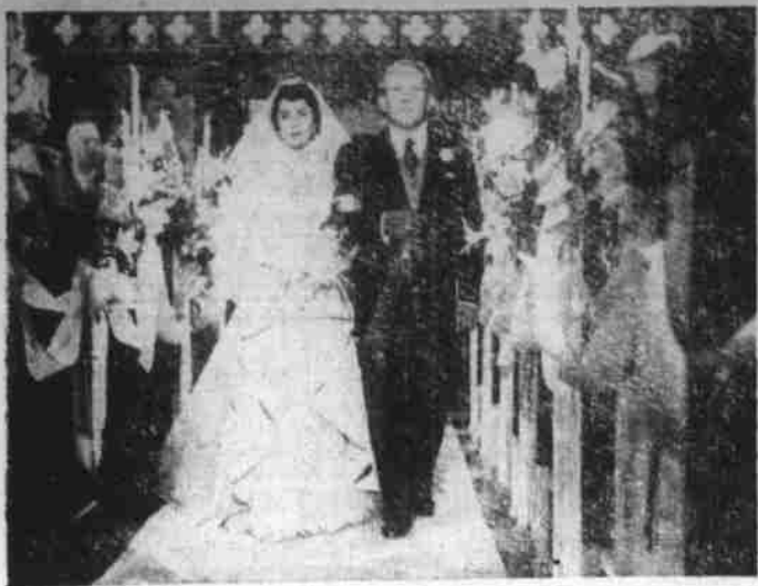
Elizabeth Taylor is about to be married in this scene from "Father Of The Bride," which co-stars Spencer Tracy and Joan Bennett.

Wounded Animals Repeated washing of wounds on animals is not necessary or advisable, as water and dampness retard healing.