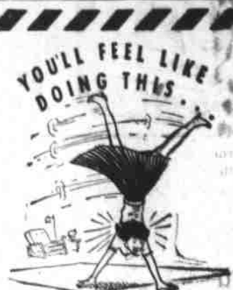
Folks who've insulated their homes with fire-proof Gold Bond Rock Wool get a real thrill from its new comfort—

Use five per cent chlordane dust to kill wire-worms and grubs in the garden soil. Put 20 ounces of the dust on each 1000 square feet of soil just before disking or spading and work well into the top few inches.