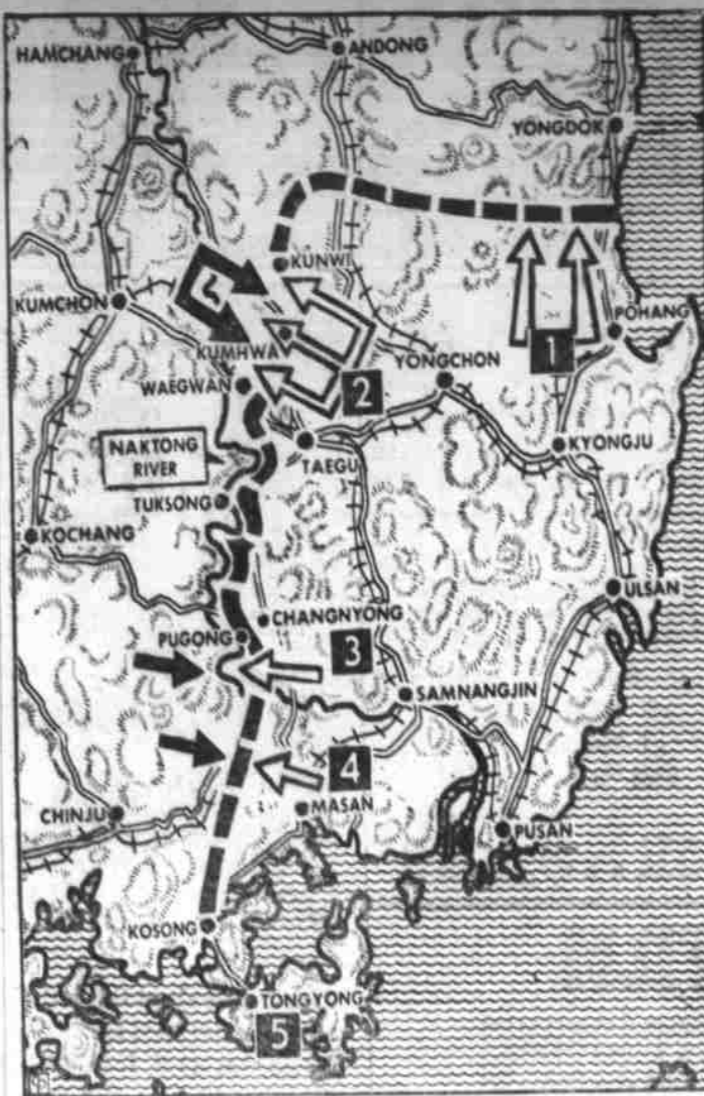
FIGHTING FLARED around the 150-mile South Korean perimeter with U.N. recapture of Pohang (1), east coast port. Communist stabs at Taegu (2) were met by U.N. counter-attacks on the northwest and toward the north Nakdong River sector. On the central Nakdong, U. S. forces flattened the Changnyong (3) bulge, clearing the Reds from the east bank. To the south at Masan (4), enemy probes were repelled. South Koreans took the island of Tongyong (5).