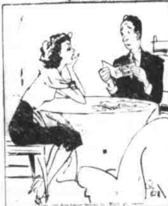
"The bank must have made a mistake. I never do."