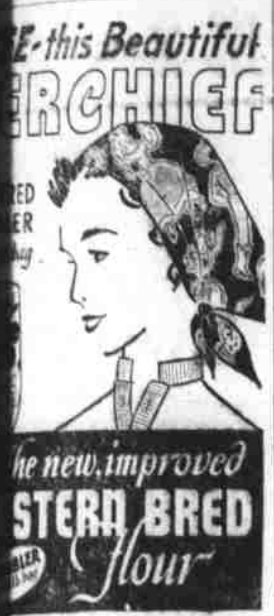
the new improved STERD BRED flour

Africa has two snow-capped mountains, Kenya and Ruwenzori, almost squarely on the Equator.